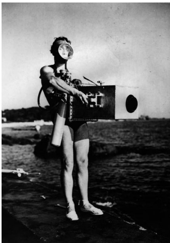
Jean Painlevé, French scientist and filmmaker, 1902–1989